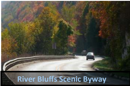
River Bluffs Scenic Byway