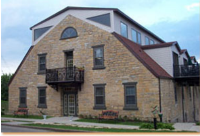
701-South River Park Drive