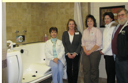
Tub Room Renovation for handicapped access