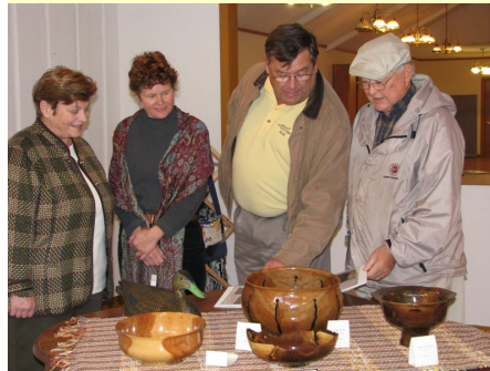
Community Art Gallery and Center